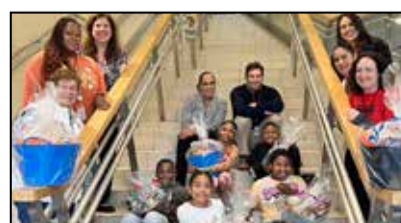
New Visions School