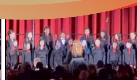
J.W. Dodd Middle School