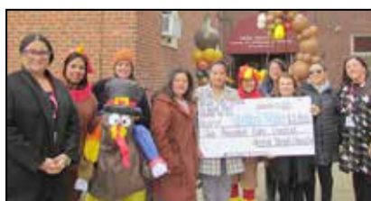
Archer Street School