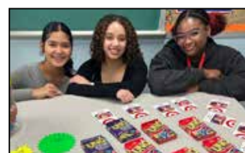
Freeport High School Class of 2024