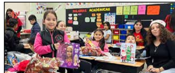
Freeport High School Spanish Honor Society

Members of Freeport High School Class of 2024 used donations from a fundraiser to purchase presents for children living in the community who were randomly selected. Members of the Freeport High School Spanish Honor Society surprised students at Archer Street School with holiday gifts and spent time with the younger students working together on several fun activities.