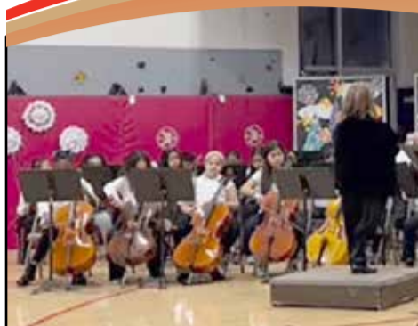
Leo F. Giblyn School