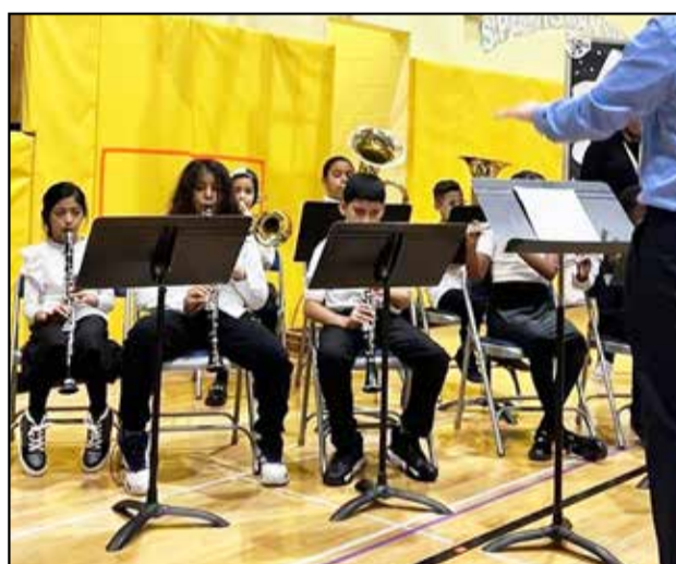
New Visions School