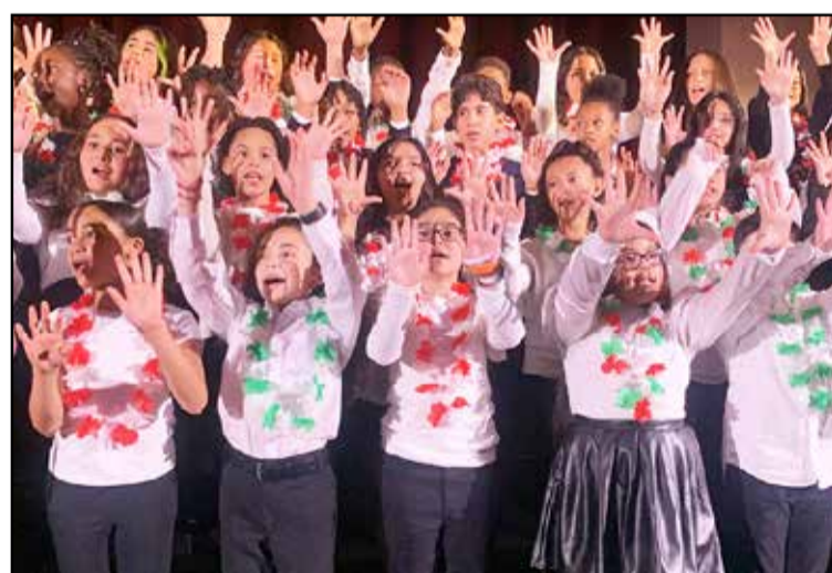
Caroline G. Atkinson School

The delightful musical sounds were paired with a beautiful display of artwork from the art education department. The slideshow highlighted the skills and creativity of the visual art students since the beginning of the school year.