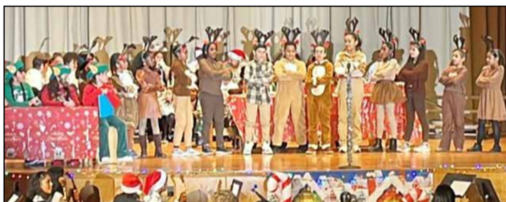
Bayview Avenue Elementary School

Freeport School District Postal Customer Freeport, NY 11520