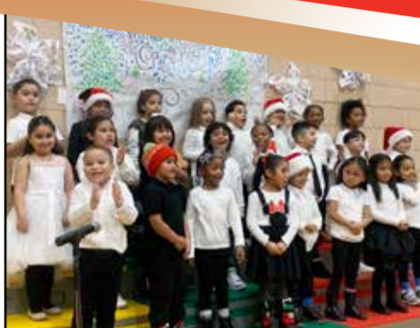
Columbus Avenue School