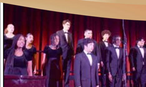
Freeport High School