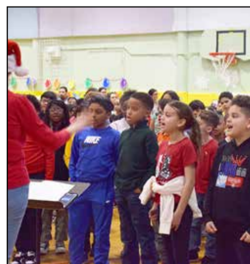
Archer Street School

Freeport Public Schools 235 N. Ocean Ave. Freeport, NY 11520